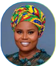
Hon. Dorcas Affo-Toffey MP, Jomoro