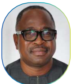
Hon. Issifu Seidu (MP) Minister of State for Climate Change and Sustainability in Ghana