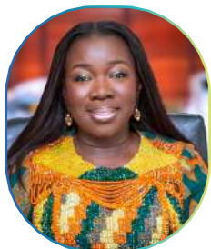
Hon. Elizabeth Ofosu-Adjare Minister for Trade, Agribusiness and Industry