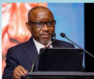
H.E., Rt. Hon. Ekperikpe Ekpo, Hon. Minister of State, Petroleum Resources (Gas), Nigeria