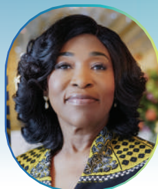
H.E. Shirley Ayorkor Botchwey Secretary-General of the Commonwealth