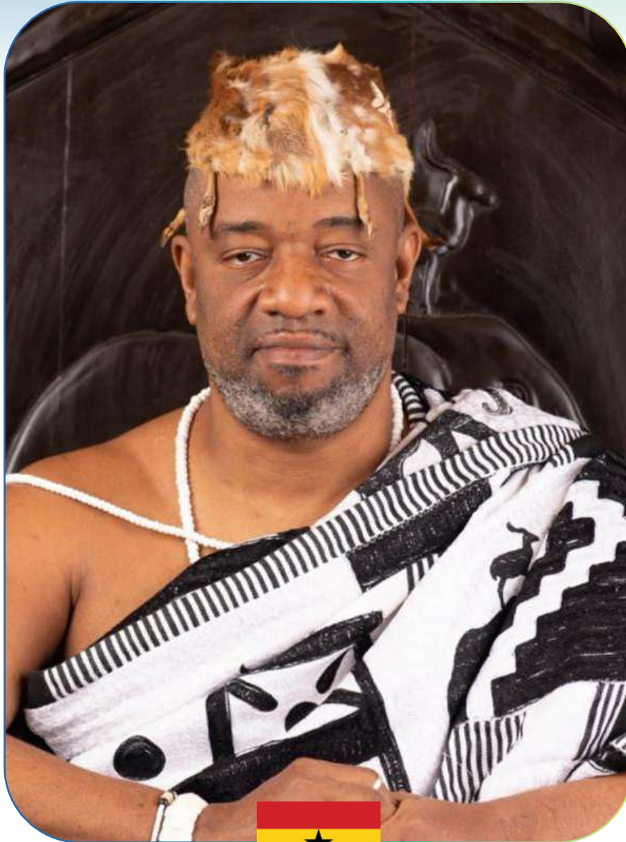
HRM KING TACKIE TEIKO TSURU II, Ga Mantse & The President of the Ga Traditional Council