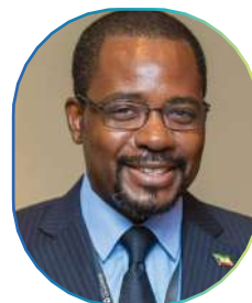
Gabriel Mbaga Obiang Lima Minister of Hydrocarbons of the Republic of Congo