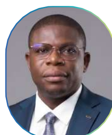
Hon. Richard Gyan-Mensah Deputy Minister of Energy and Green Transition, Ghana