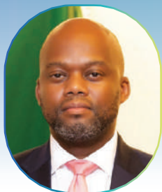
H.E. Wamkele Mene Secretary-General, The Africa Continental Free Trade Area (AfCFTA)