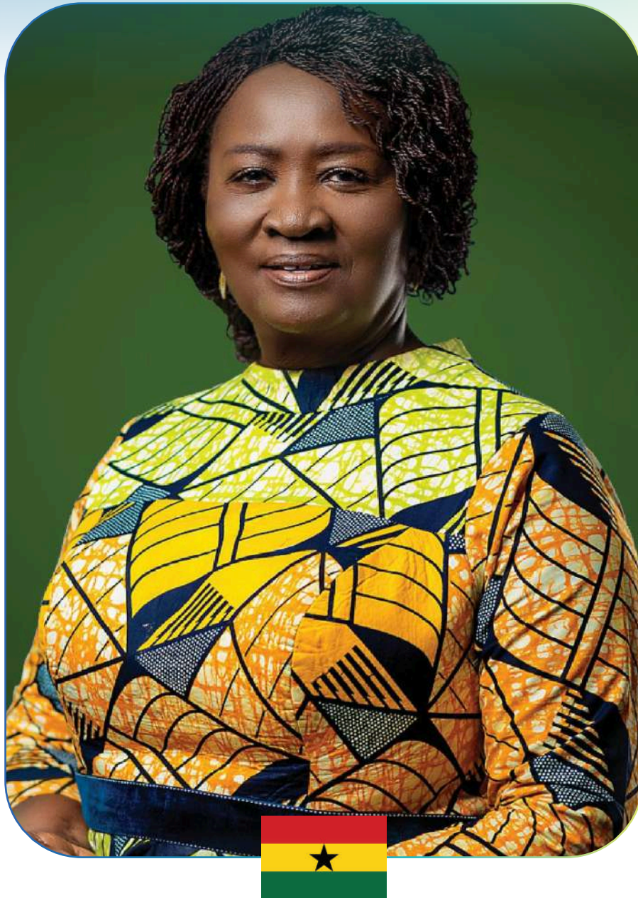
H.E. NAANA JANE OPOKU-AGYEMANG, PhD, FGA Vice President of the Republic of Ghana