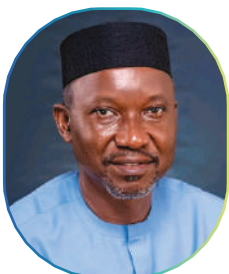
Hon. Ekperikpe Ekpo Minister of State, Petroleum Resources (Gas), Nigeria