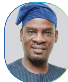
Hon. Haruna Iddrisu Minister of Education, Ghana