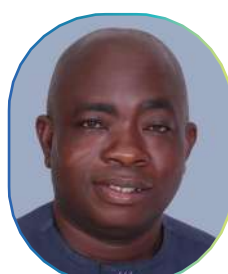
Hon. Sampson Ahi Deputy Minister for Trade, Agribusiness and Industry