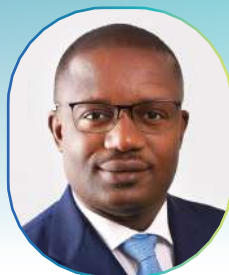
Hon. Dr. John Abdulai Jinapor (MP) Minister of Energy and Green Transition, Ghana