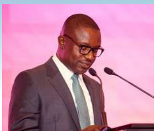
Hon. John Abu Jinapor, Minister for Energy and Green Transitions, Republic of Ghana