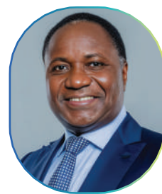
Hon. Sangafowa-Coulibaly Mamadou Minister for Mines, Petroleum and Energy, Ivory Coast