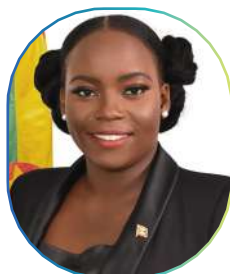
Hon. Kerryne Z. James Minister for Climate Resilience, Grenada