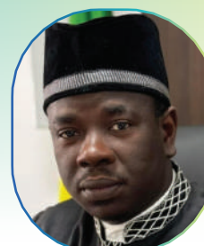
Hon. Birame Soulyèye Diop Minister of Energy, Petroleum and Mining, Senegal