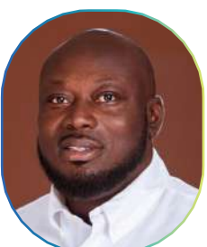
Hon. George Opare Addo, Minister of Youth Development, Ghana